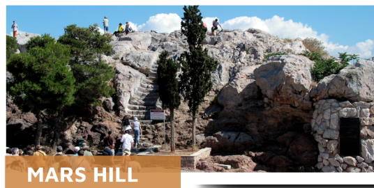
✓ MARS HILL

In Thessalonica, Paul established a church (Acts 17:1-9) to whom he wrote two letters (1 & 2 Thessalonians). At the Roman Agora (marketplace), a mob formed against Paul, and an ensuing riot started (Acts 17:5).