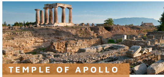
✓ TEMPLE OF APOLLO

Paul probably stopped here after sailing from Illyricum (Rom 15:19) and later spent the winter in Nicopolis (1 Tim 3:12).