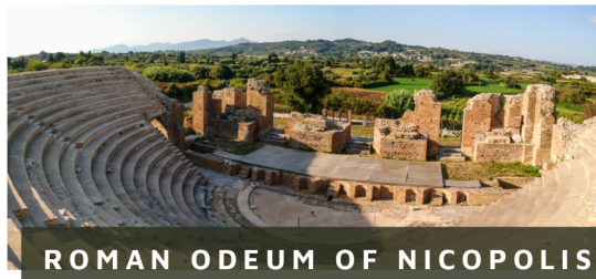
✓ ROMAN ODEUM OF NICOPOLIS

Here, you'll see Mars Hill, where Paul addressed the city leaders (Acts 17:19-33). See also the Parthenon, the Stoa of Attalos, the Theater of Dionysus, the Odeon of Herodes Atticus, the Temple of Hephaestus, the Arch of Hadrian and the Temple of Olympian Zeus.